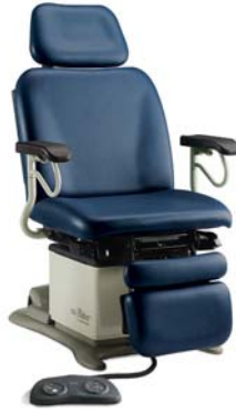
Ritter 230 Universal Power Procedures Table (Shown with adjustable arm system accessory)